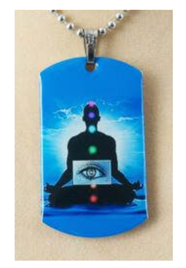
Chakra Aura Third Eye Activation Mec Tech Cell

All you do is place your favorite Mec Tech Power Cell on your left wrist pulse with the Sacred geometry Sigil touching your pulse point. Then you just place your watch over the sigil and strap it to your wrist to secure it there and hit the power button. You're now sending Mec Tech Power coursing through your very veins!!