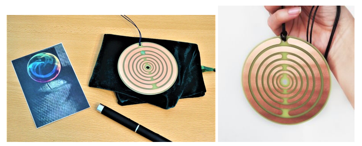
Boost The Power Of Your Tachyon Watch Dramatically With Your Own Prana Energy Accumulating Disc And Healing Shield.

So what are you waiting for? Start helping the world around you with Tachyon Power and Mec Tech Power Cell Technology!