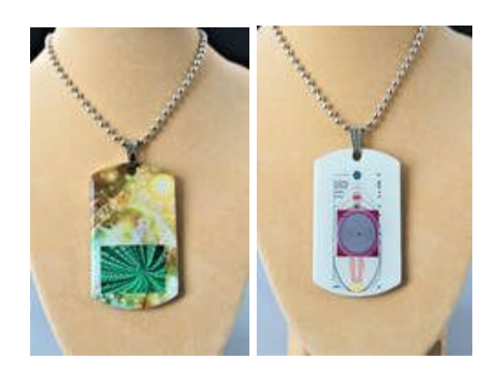
Healing/Chakra Activation Mec Tech Cell

With these two masterpieces of ancient energy technology working with you, you can literally increase the amount of vital force you draw from the heavens and the earth by 90%! The average person is only able to draw on about 20% of the boundless vitality of nature.