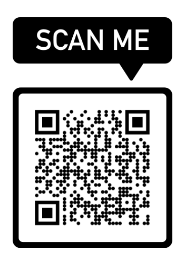
Check out our youtube channel for more FREE content!