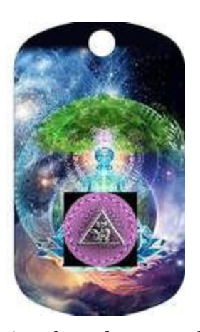
Fountain Of Youth Mec Tech Cell