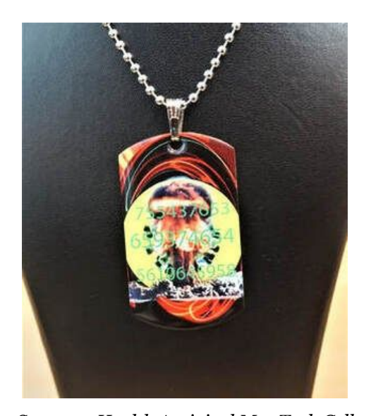
Supreme Health Antiviral Mec Tech Cell

If you're serious about getting healthy and staying healthy and you're starting to realize that your government may not always be able to help you in a way that benefits YOU, then you may want to consider taking your health into your own hands. Our new <a href="Supreme Health and Antiviral Mec Tech Cell">Supreme Health and Antiviral Mec Tech Cell</a> will help provide an immovable foundation for health and vitality for you and your loved ones.