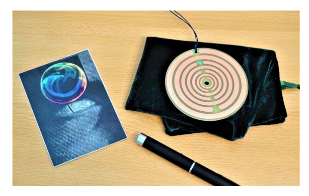
Prana Energy Accumulating Disc Kit

Having tools like our <u>Prana Energy Accumulating Disc and Healing Shield</u> is the "Lazy Bastards Way to Super Health". Not only does it strengthen your aura, but it also accumulates vital force, turning you into a battery of vital power!